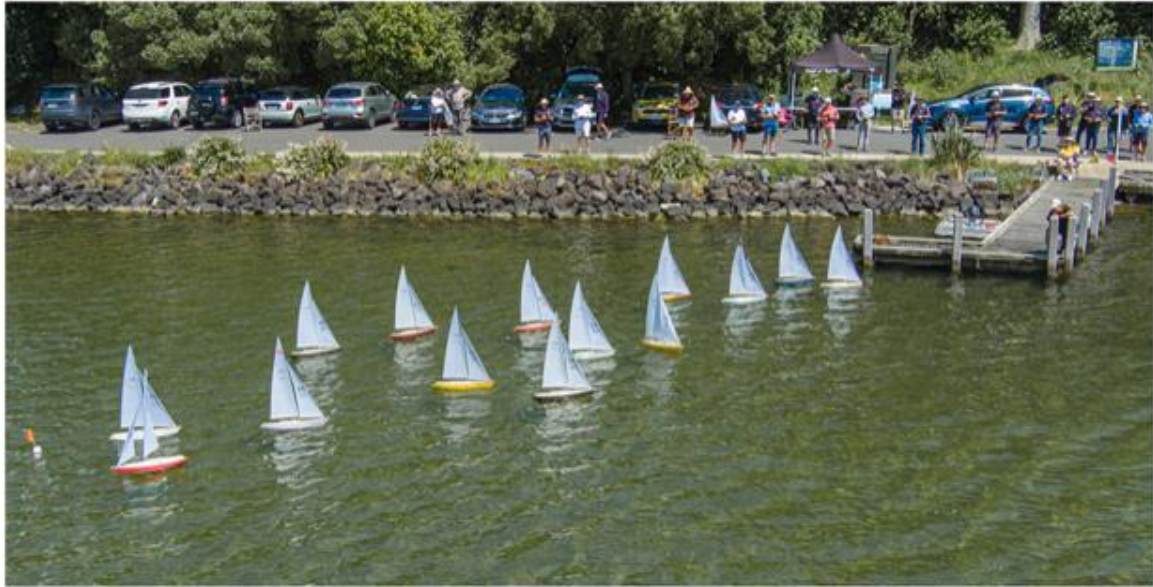
Start line cleared by the Umpires and the race is underway.